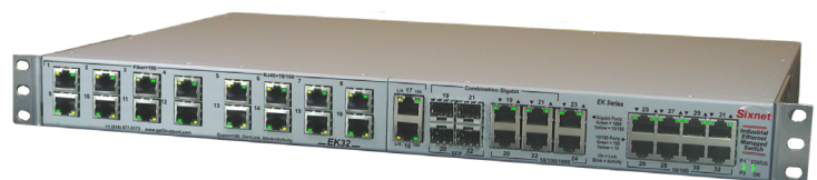
EK32FSD6N-1 with dual 24 VDC inputs and sealed IP50 (no fans!)